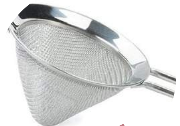
Fine Mesh Strainer

This guide contains affiliate links, which means I'll receive a commission if you purchase through my link, at no extra cost to you.